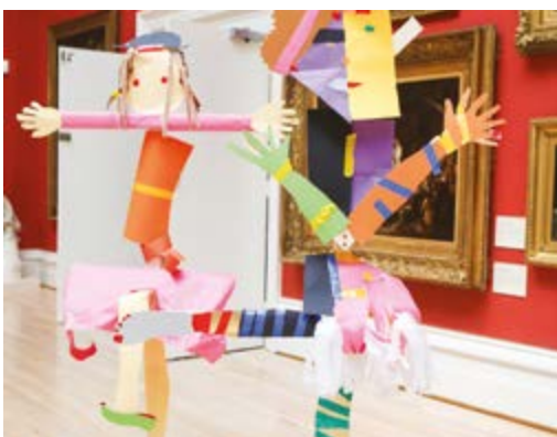
Children's Art Week, New Walk Museum and Art Gallery.

Does your school have, or is it working towards an Artsmark? Visit www.artsmark.org.uk for more information.