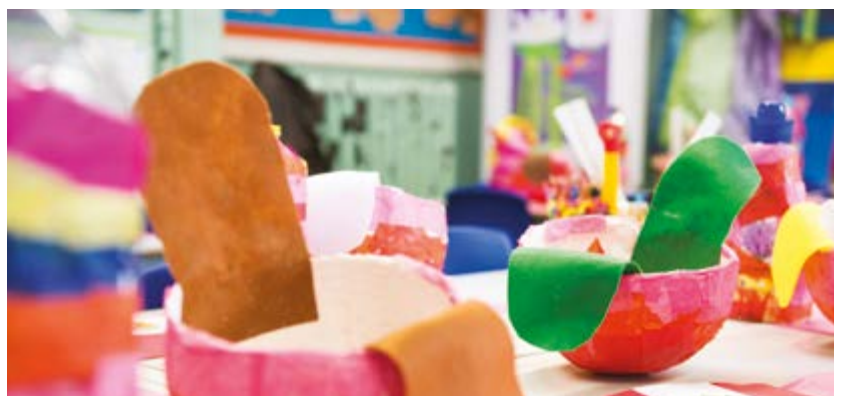
Comber Grove Primary School, Southwark, London.