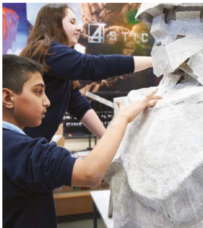
Ovingham Middle School.

This document has been created through the partnership working of NSEAD, Arts Council England and the National Governors' Association.