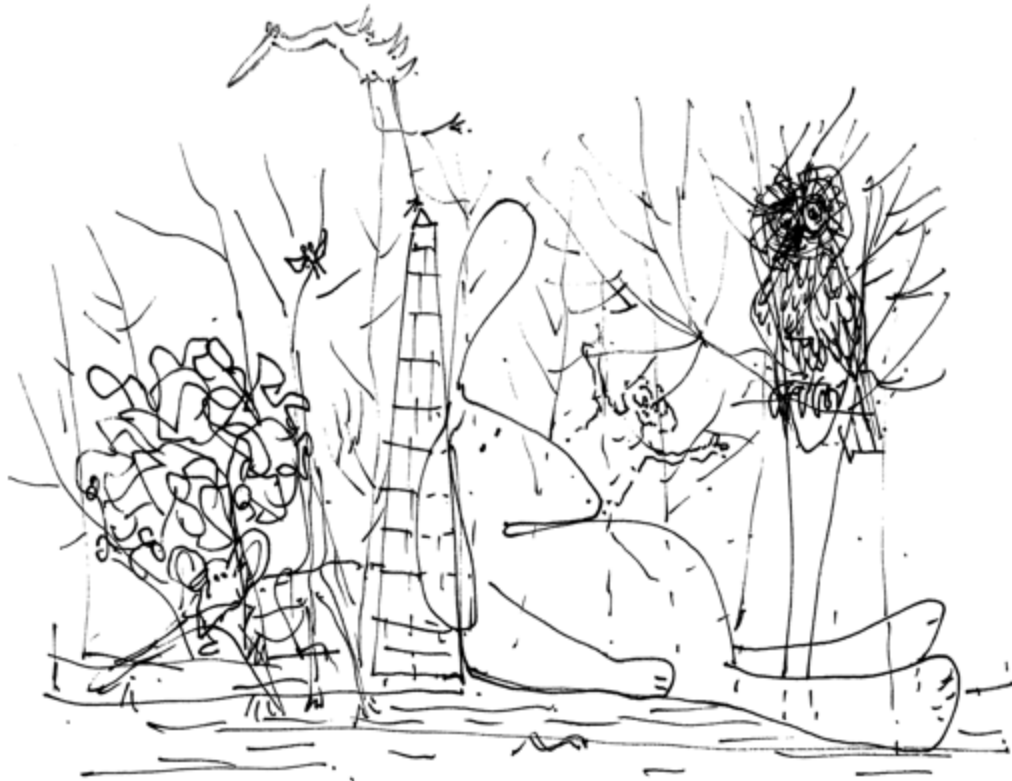
Forest of Imagination 2015.