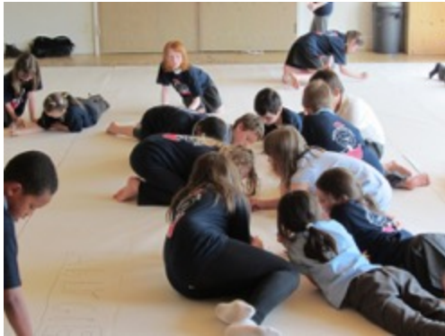
School Without Walls www.schoolwithoutwalls.org.uk