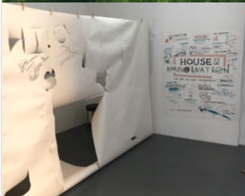
House of Imagination https://5x5x5creativity.org.uk/