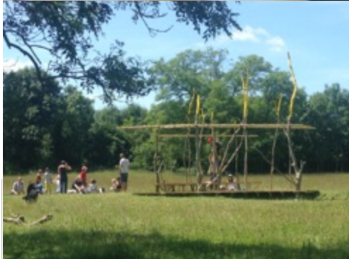
Forest of Imagination www.forestofimagination.org.uk