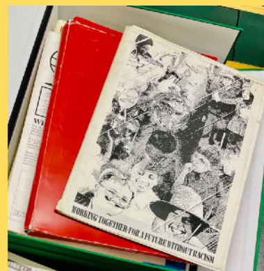
Image: Panchayat Collection archive box