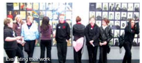
Evaluating their work