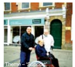
Theme – 'Support'