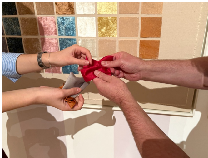
Participants using the sensory inclusion resource created for the Yto Barrada Thrill, Fill and Spill exhibition at South London Gallery.