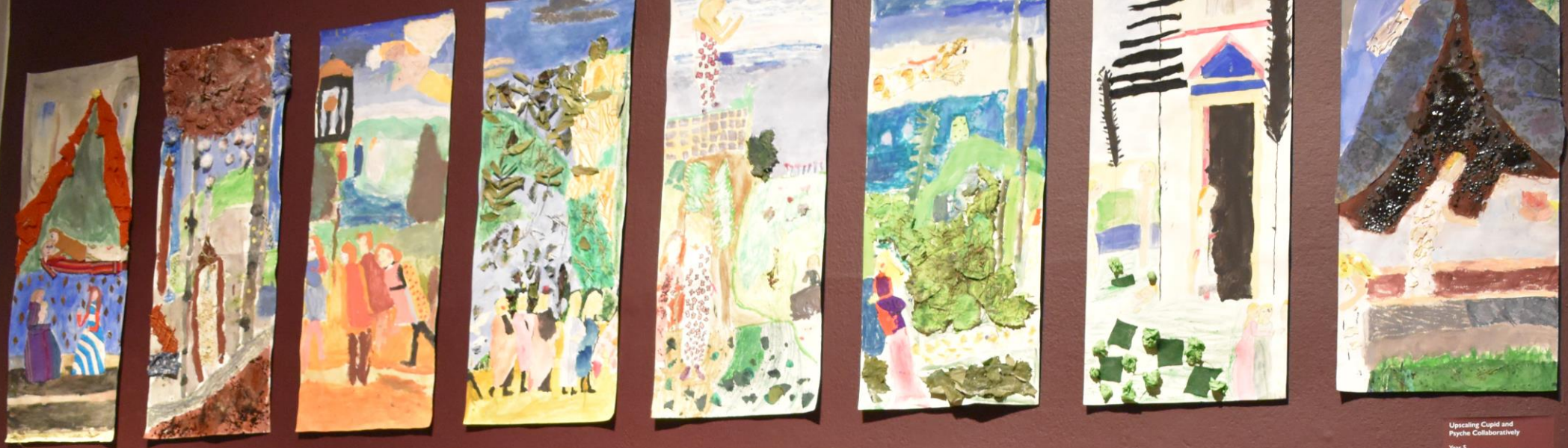
Upscaling Cupid and Psyche Collaboratively Year 5 Linton High Junior School Mixed media